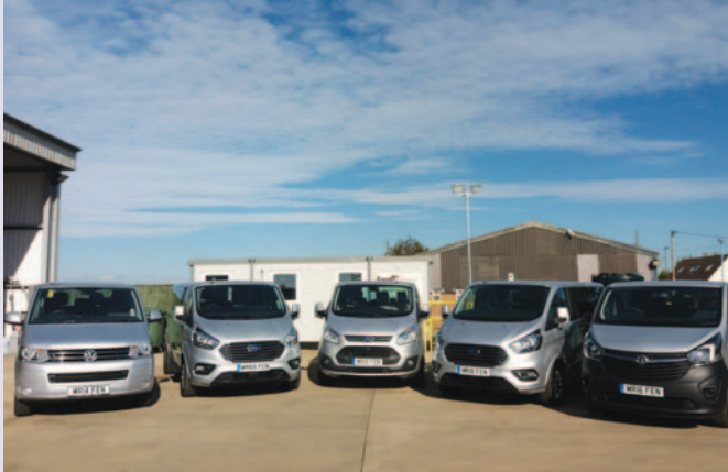
Please note: Conditions apply

We include free collection from your front door and return you home at the end of your holiday by either taxi or one of our own smart minibuses, what could be more stress free?